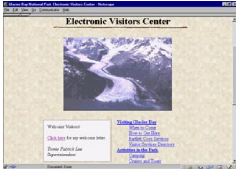
Figure 4. High individualist value: US National Park Website.

The effects of these differences can be illustrated on the Web by examining national park Web sites from two countries with very different IC indices (Figures 4 and 5). The Glacier Bay National Park Website ( www.nps.gov/glba/evc.htm ) is located in the USA, which has the highest IC index rating (91).