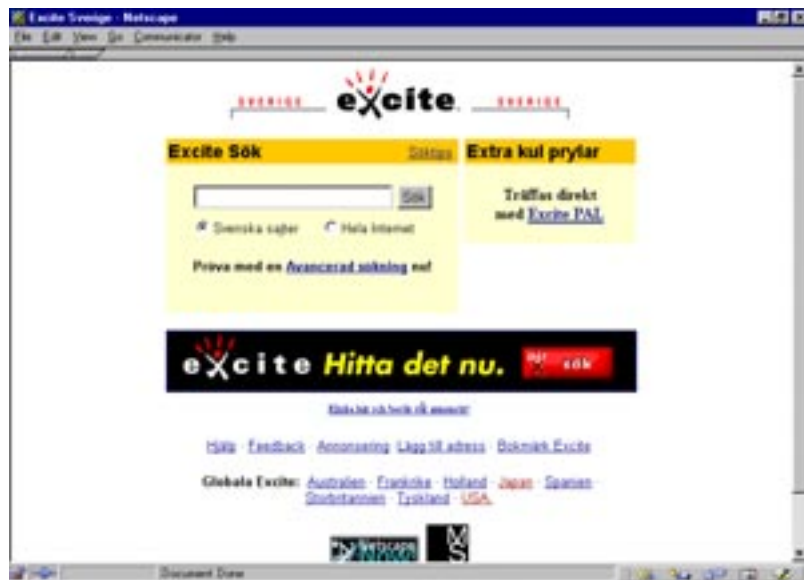
Figure 9 Low masculinity Website: Swedish Excite.com.

The Excite Website (www.excite.com.se) from Sweden, with the lowest MF value 5, makes no distinction in gender or age. (With the exception of the Netherlands, another low MAS country, all other European Websites provide more pre-selected information.)