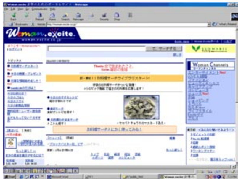
Figure 7. High masculinity Website: Excite.com for women in Japan

Examples of MAS differences on the Web can be illustrated by examining Websites from countries with very different MAS indices (Figures 7 and 8). The Woman.Excite Website (woman.excite.co.jp) is located in Japan, which has the highest MAS value (95). This Website narrowly orients its search portal toward a specific gender, which this company does not do in other countries.