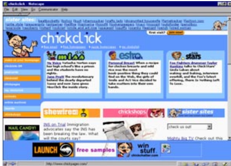
Figure 8. Medium masculinity Website: ChickClick.com in the USA.

The ChickClick USA Website (MAS = 52) consciously promotes the autonomy of young women (although it leaves out later stages in a woman's life.)