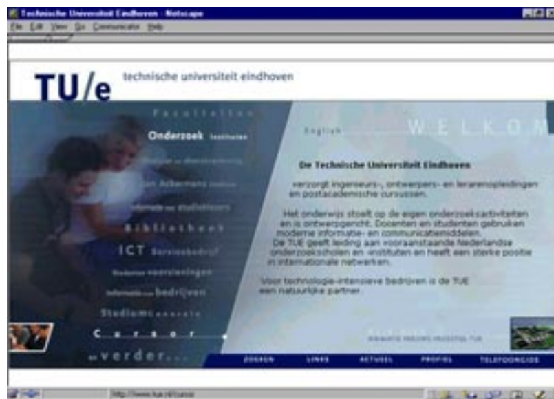
Figure 3b. Low power distance: Dutch Educational Website

Note the differences in the two groups of Websites. The Malaysian Website features strong axial symmetry, a focus on the official seal of the university, photographs of faculty or administration leaders conferring degrees, and monumental buildings in which people play a small role. A top-level menu selection provides a detailed explanation of the