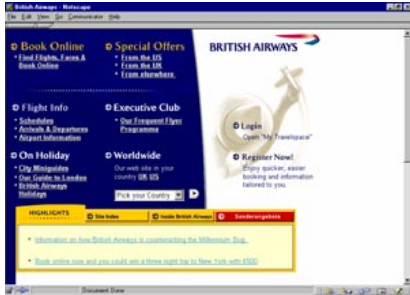
Figure 11. Low uncertainty avoidance: British Airways Website from United Kingdom.

The British Airways Website ( www.britishairways.com ) from the United Kingdom (UA = 35) shows much more complexity of content and choices with popup windows, multiple types of interface controls, and “hidden” content that must be displayed by scrolling.