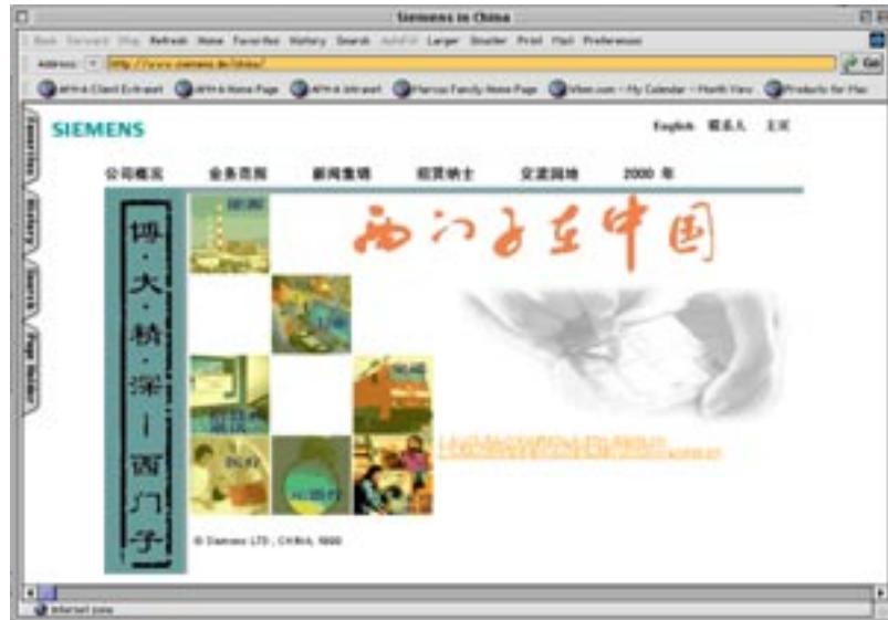
Figure 13. High Long-Term Orientation. Website from Siemens in China.

The Chinese version from Beijing requires more patience to achieve navigational and functional goals.