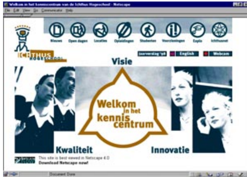
Figure 3a. Low power distance: Dutch Educational Website.

The Website from the Ichthus Hogeschool ( www.ichthus-rdam.nl ) and the Technische Universiteit Eindhoven ( www.tue.nl ) are located in the Netherlands, with a PD index rating of 38.