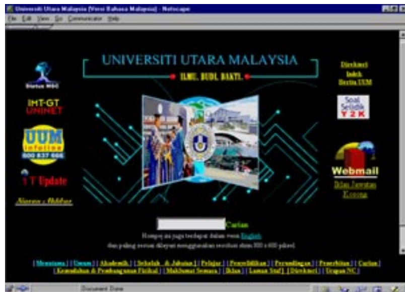
Figure 2. High power distance: Malaysian University Web site.

These PD differences can be illustrated on the Web by examining university Web sites from two countries with very different PD indices (Figures 2 and 3). The Universiti Utara Malaysia ( www.uum.edu.my ) is located in Malaysia, a country with a PD index rating of 104, the highest in Hofstede's analysis.