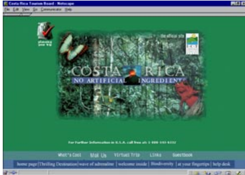
Figure 5. Low individualist value: Costa Rican National Park Website.

The Website from the National Parks of Costa Rica ( www.tourism-costarica.com/ ) is located in a country with an IC index rating of 15.