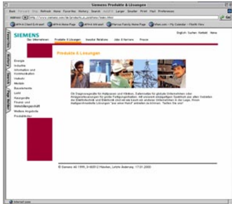
Figure 12. Low Long-term orientation: Website form Siemens Germany.

Examples of LTO differences on the Web can be illustrated by examining versions of the same company's Website from two countries with different LT values (Figures 11 and 12). The Siemens Website ( www.siemens.co.de ) from Germany (LT=31) shows a typical Western corporate layout emphasizing crisp, clean functional design aimed at achieving goals quickly.