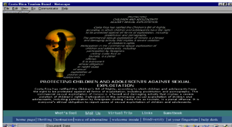
Figure 6. Costa Rican Website What's Cool contents: Political message about exploitation of children.

The third image (Figure 6) shows a lower level of the Costa Rican Website.