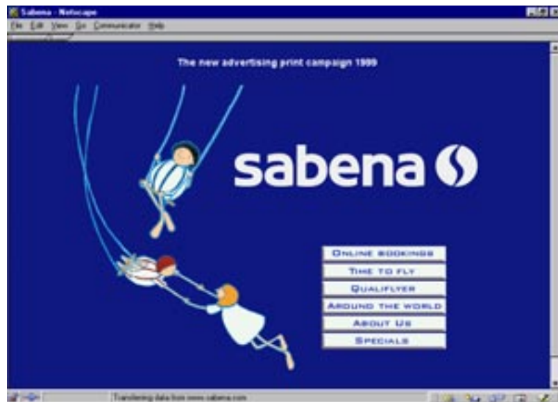
Figure 10. High uncertainty avoidance: Sabena Airlines Website from Belgium.

Examples of UA differences can be illustrated on the Web by examining airline Websites from two countries with very different UA indices (Figures 9 and 10). The Sabena Airlines Website ( www.sabena.com ) is located in Belgium, a country with a UA of 94, the highest of the cultures studied. This Website shows a home page with very simple, clear imagery and limited choices.